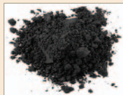
Black Iron Oxide