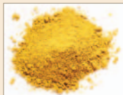
Yellow Iron Oxide