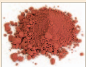
Red Iron Oxide