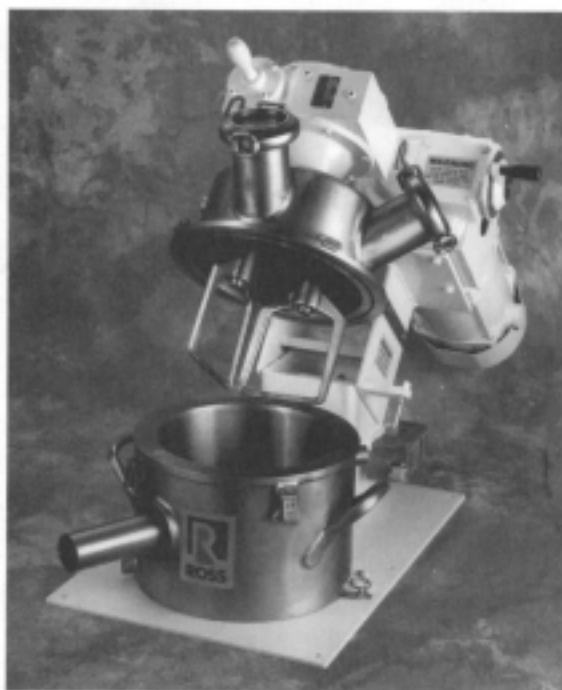
One gallon Double Planetary Mixer – produced by Charles Ross & Son Company, Hauppauge, New York

He then may go to a 1 or 2 gallon machine to produce 8 – 12 10 oz tubes for more in depth testing and customer sampling. The sealant is extruded from the pot through a metal cylinder into the cartridge which fits over the packaging cylinder. Following these tests, he is ready for scale up.