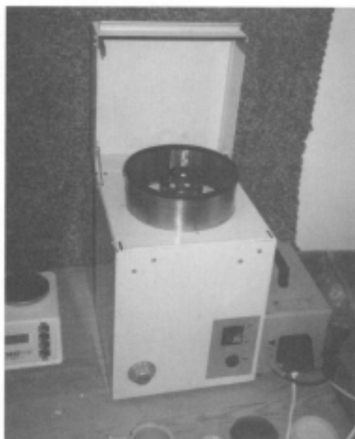
Hauschild Speed Mix from FlackTek Inc, Landrum South Carolina

Here, the lab chemist has new ideas and typically starts with a hand batch of about 100 grams of sealant just to see how it cures and what kind of rubber is produced. Now there is a new machine available “The Hauschild Speed Mix” from FlackTek Inc. This specialized machine is ideal for mixing these small 100g batches in seconds while expelling air. This is important since it now allows the developer to actually test the physical properties of these small batches. Fumed silica or other fillers such as precipitated chalks can be mixed into the silicone in about 8 seconds. De-airing takes about 20 – 25 seconds. The machine works by way of a dual asymmetric centrifuge mechanism which basically uses the particles themselves as their own mixing arms. The maximum mix size is 100 grams and several different cup types are available including disposable, which means absolutely no cleaning.